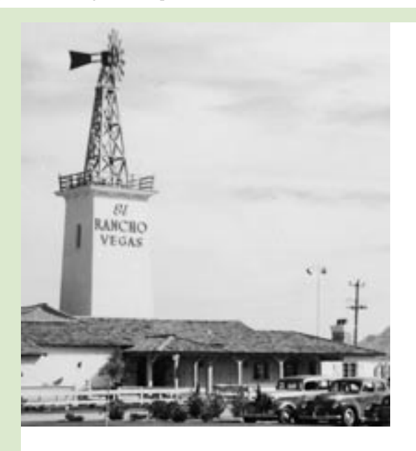
Fig. 1. El Rancho Vegas in the 1940s. The unprepossessing main building doesn't seem to point towards the giantism and flash of today's Las Vegas Strip – but today's casino resorts are strikingly similar in philosophy to the El Rancho.

(Detail - click the picture to view a larger image)