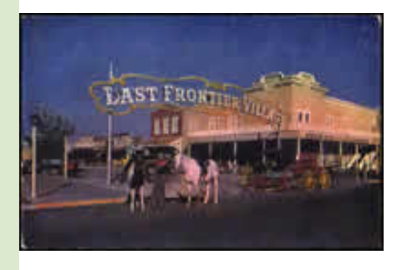
Fig. 6. The entrance to the Last Frontier Village. This village predated Disneyland as a consumerbased themed fantasy town.

In 1947, Griffith and Moore convinced Cauldhill to open his heretofore private collection to public view and designed the Last Frontier Village around it. The village was designed to display artifacts so that "the public would be allowed to see it and use it and actually were not charged for viewing it." But Moore did not only want to preserve the past; he admitted that he wanted to use it as "an advertising method in order to induce people to come to the hotel and stay there–patronize the hotel, patronize the village" (Moore, 1981).