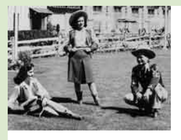
Fig. 4. Friendly neighbors from the Old West styling on the ground of the Last Frontier in the early 1950s.

(Detail - click the picture to view a larger image)