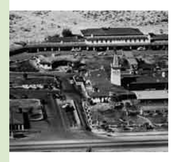
Fig. 3. A bird's eye view of the El Rancho Vegas in its first decade. The insular nature of the first trip casino resort is clear from this photograph, and the motel bungalows surrounding the main building recall a suburban subdivision. The then lowrise city of Las Vegas is scattered to the north.

the El Rancho's vacation cottages suggests the private space of the suburbs.