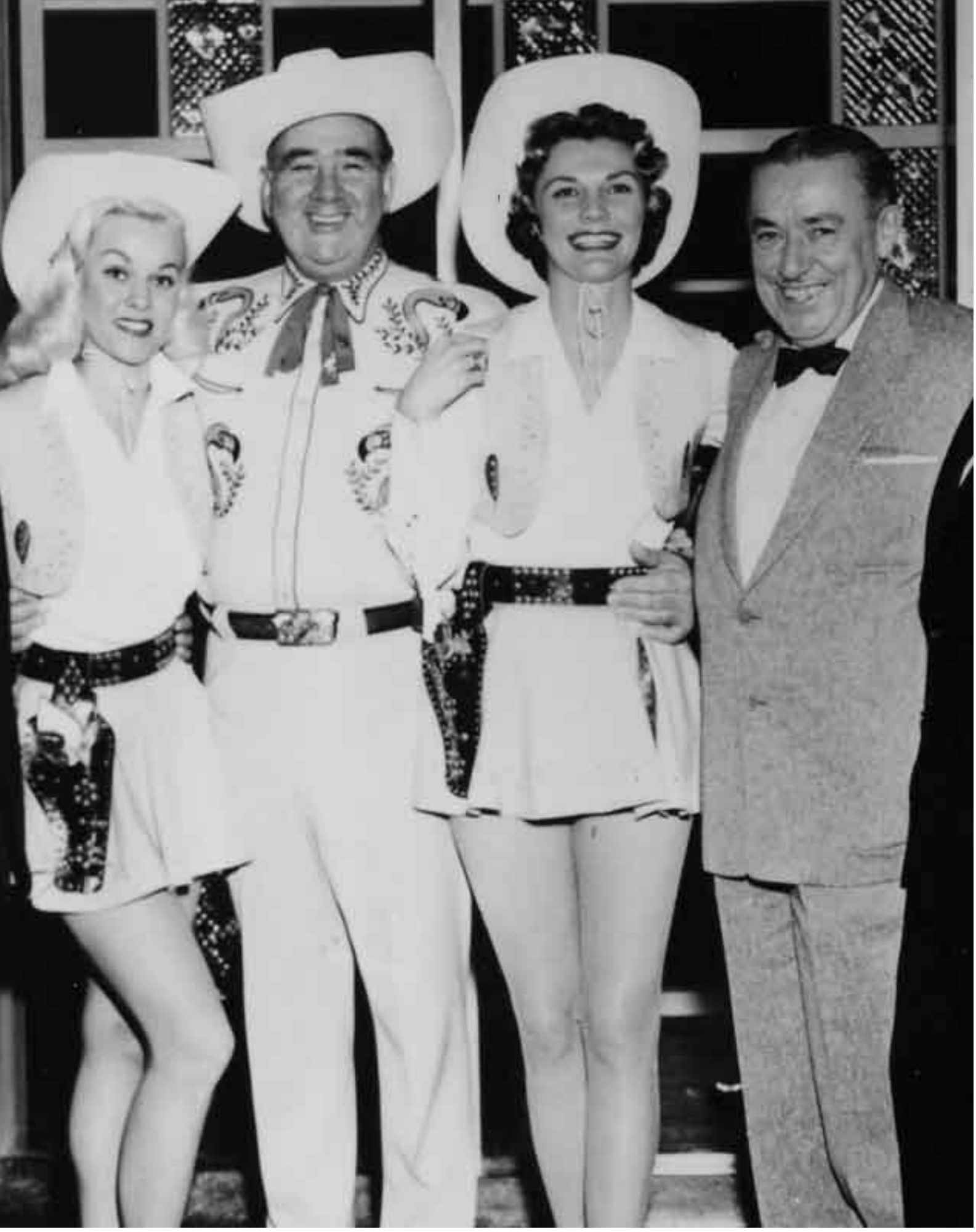
http://www.camh.net/egambling/issue3/photos/f2thomas_hull.jpg (1 of 2) [6/23/2002 10:02:39 PM]